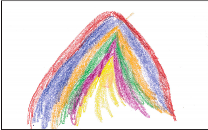
The Boutique supports children in Liberty House & Wise Options like those who created the artwork throughout this report.